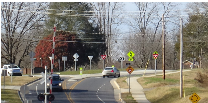
The photo above shows the roundabout on Duke Street at Hunter Creek Drive on 1/17/21.