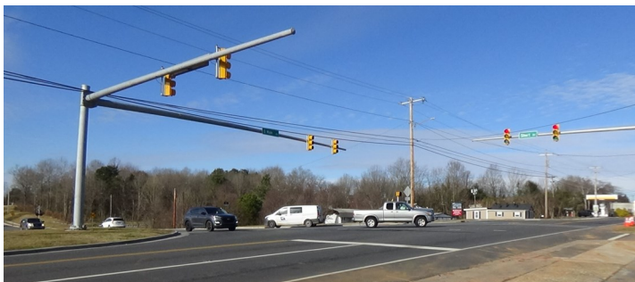
The above photo shows the access to Duke Street from South Main Street on 1/17/21.