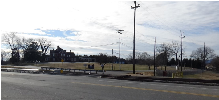
The photo above was made 1/17/21. It shows the site of the intersection that once connected South Main Street with Duke Street.

The intersection at Duke Street, South Main Street, and Central Avenue closed at the end of January 2020. The main access to Duke Street from South Main (aka Hwy 321A) is now located at Short Street, which is about .3 mile south of the old intersection. That access leads to a roundabout on Duke Street where it intersects with Hunters Creek Drive. Guard rails at the old intersection keep cars from crossing the railroad track. In addition, the side road that ran between the old Paradise Mill and the railroad track has been closed off at the intersection. Although traffic once used it for a short cut, the road is privately owned. Traffic can still access Duke Street and Central Avenue via Midway Street. The new route eliminates the old, unsafe intersection where traffic came from six different directions. Photos below show the closed intersection, the new intersection, and the new roundabout.