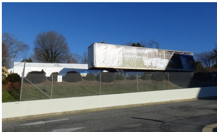
The photo above shows a view of the field hospital from the front parking lot at CMH. The location offers both privacy and security.